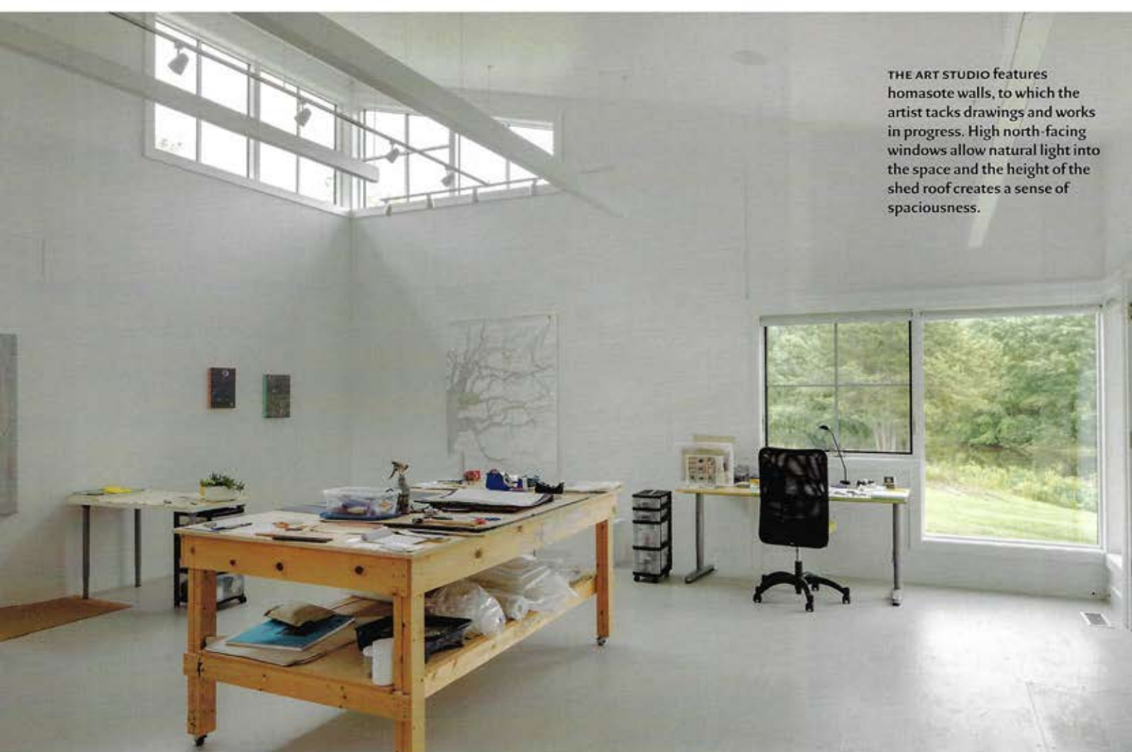
THE ART STUDIO features homasote walls, to which the artist tacks drawings and works in progress. High north-facing windows allow natural light into the space and the height of the shed roof creates a sense of spaciousness.