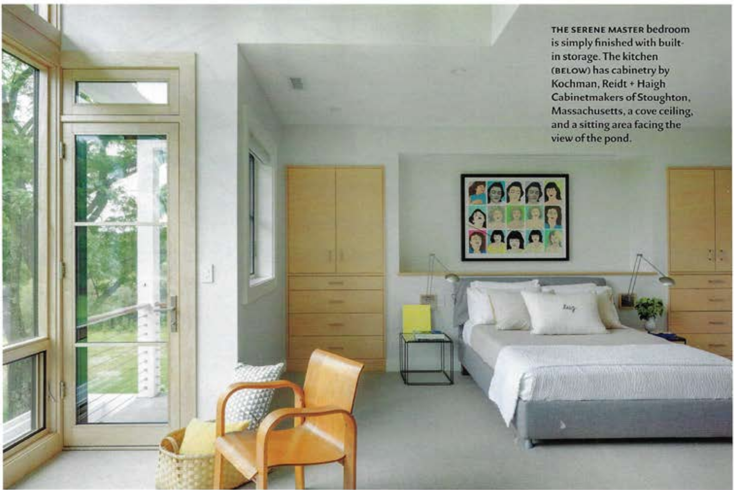
THE SERENE MASTER bedroom is simply finished with built-in storage. The kitchen (BELOW) has cabinetry by Kochman, Reidt + Haigh Cabinetmakers of Stoughton, Massachusetts, a cove ceiling, and a sitting area facing the view of the pond.