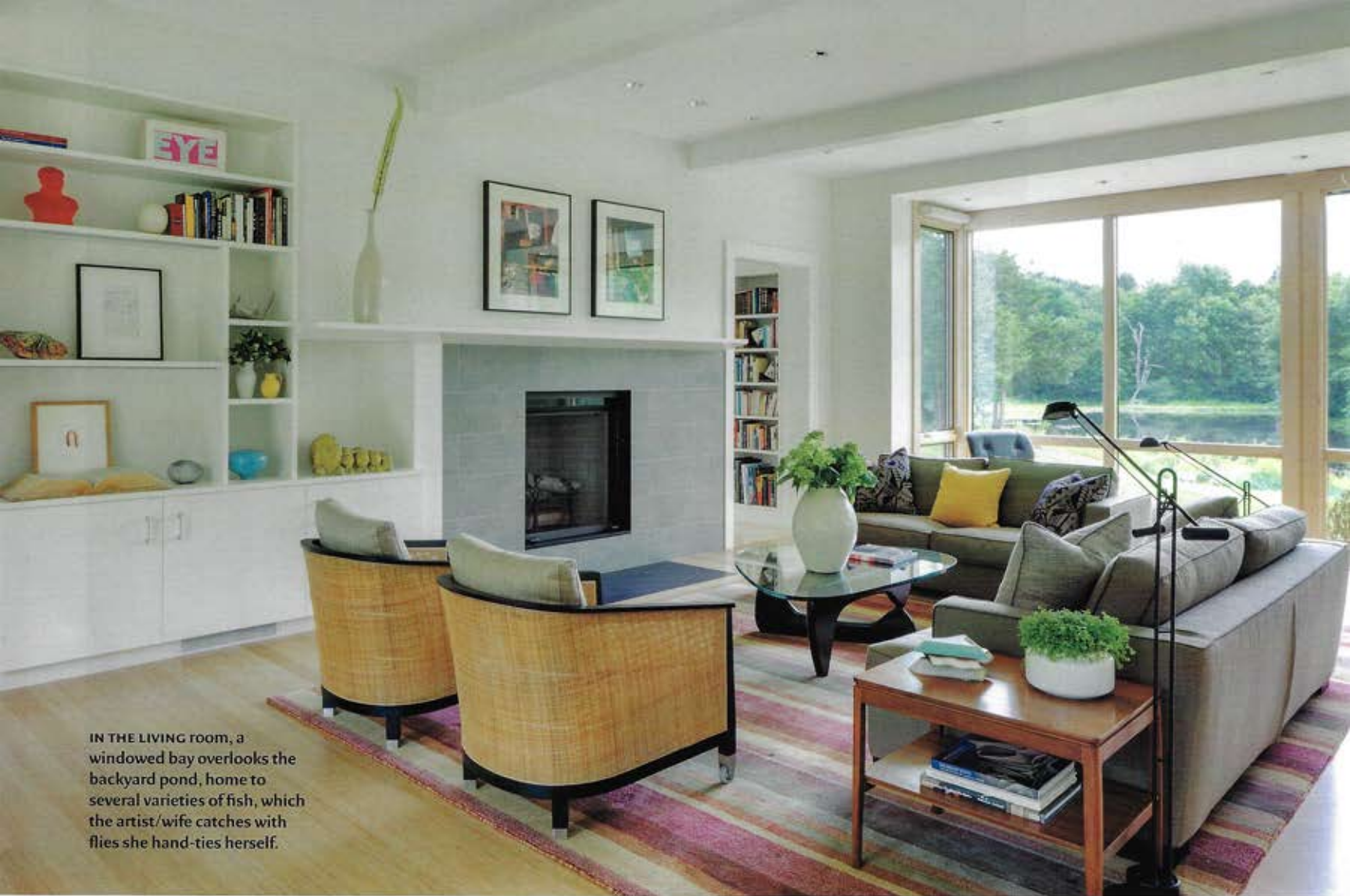
IN THE LIVING room, a windowed bay overlooks the backyard pond, home to several varieties of fish, which the artist/wife catches with flies she hand-ties herself.

design in which a linear orientation connects a main house to one or more ancillary facilities, such as a barn, a privy shed, or a stable. Battle's plan places what he calls a "modern farmhouse" between a shed (the art studio) and a barn (the recording studio). The art studio is connected to the house via a breezeway that has its own entry. In the 1,100-square-foot space, the wife paints, makes prints, and engages in whatever medium appeals to her at the moment.